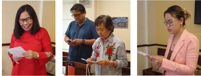
14 th Regular Luncheon Meeting... "Spouses' Day", Nov. 8, 2023 at Swiss Deli, Matina