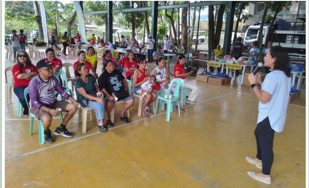
Flu vaccine & Patak Polio...